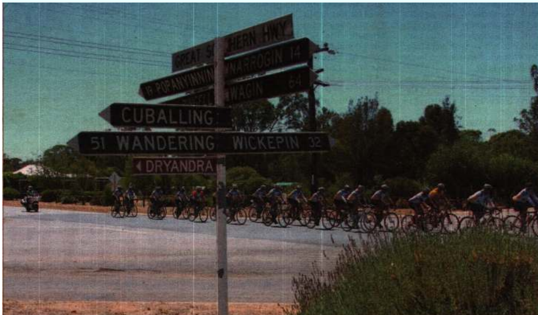
Last year's Red Sky Ride participants power through the Great Southern.

"This year's money will be used to support a post doctoral fellowship to research ways to improve cancer-related symptoms such as pain and fatigue, reduction in treatment side effects such as nausea and anxiety and improved overall quality of life," Ms Young added.